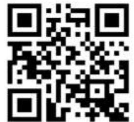
Link to class flyer

Email completed form to wamalo@gmail.com For juniors, if you email the form without the parental signature please bring the signed parental consent form with you on the day of class or you can sign the first day of class. Must have the parental consent signed to participate.