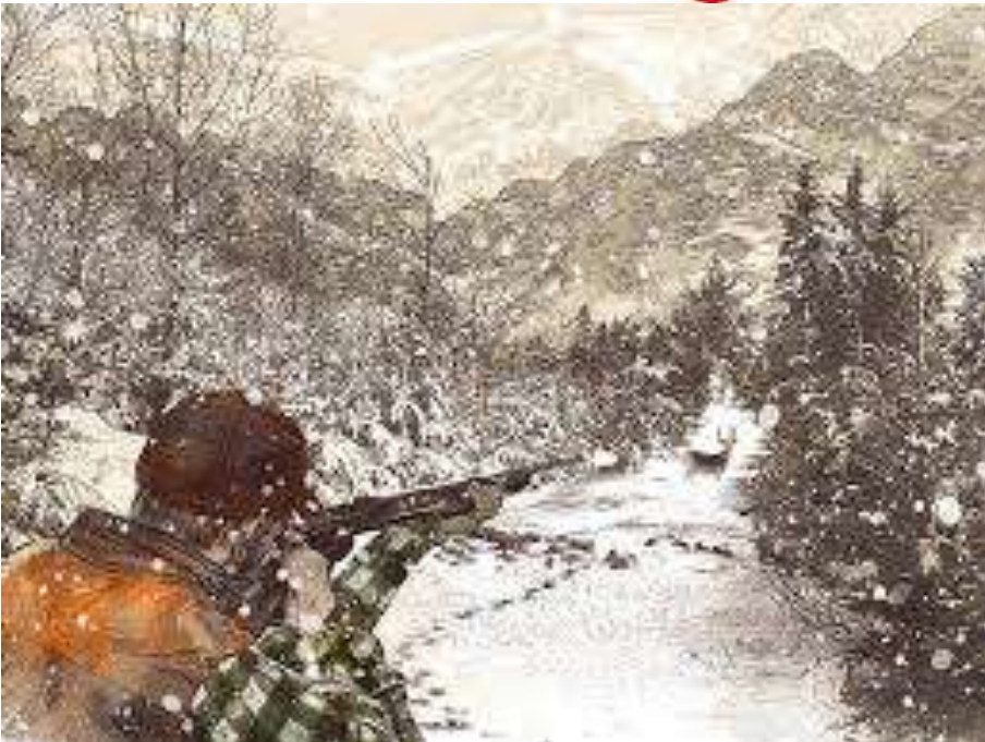
Plaid & Khaki